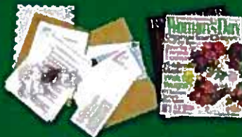
Mail, magazines, mixed paper & catalogs