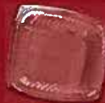
Plastic food trays