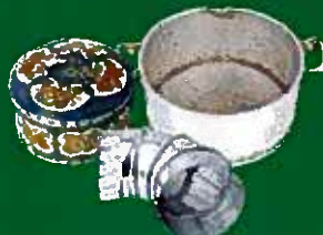
Ferrous metals maximum size (16"x16"x12")