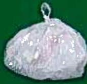
Bagged plastic bags, shrink & stretch wrap