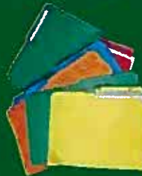
Files & file folders