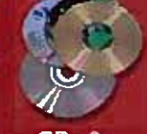
CDs & CD cases