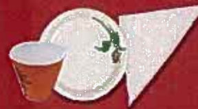
Paper plates, cups & napkins (can go in yard waste cart)