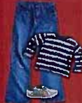
Clothing, textiles shoes