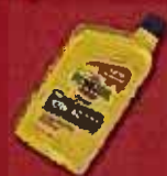
Toxic product containers