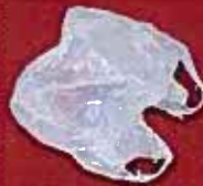
Loose plastic bags