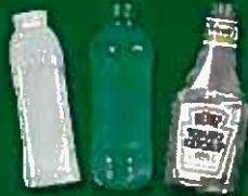
Plastic bottles (all colors)