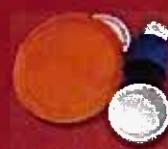
Lids, caps tops