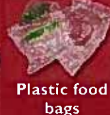
Plastic food bags