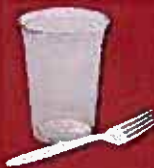
Plastic cups & utensils