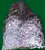
Strip-cut shredded paper (in see-thru bag)