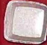
Foam take-out containers