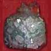
Styrofoam peanuts (prevent littering - put in bag)