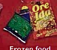
Frozen food bags