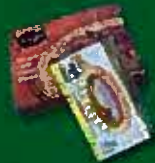
Paper or frozen food boxes